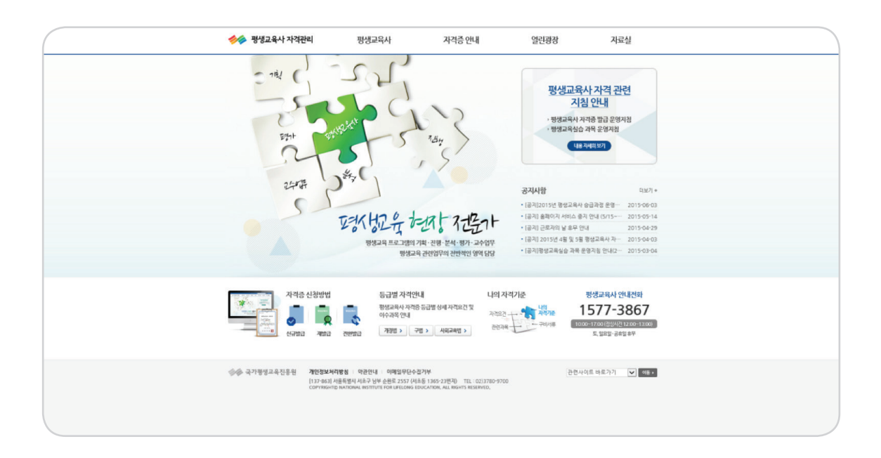
[Figure 1] Lifelong Learning Educator Certification Management Website

current trends of training centers. It also provides consulting services regarding certificate acquisition.