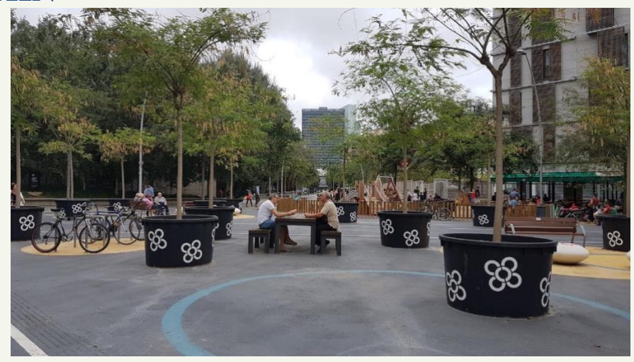
Before 2015, superblocks had become a dirty word thanks to modernist city planners. But Barcelona, Spain has reclaimed the term for a massive program to repurpose neighbourhood streets as public space, starting with Poblenou. Read more.