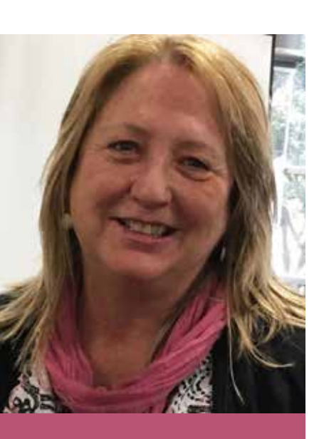
The ACE sector could play a much greater role in building community resilience post COVID-19 by offering targeted education and pathway programs; particularly for displaced workers.

Only months ago, Australia was literally on fire, with hundreds of bushfires burning around the country. These catastrophic bushfires were preceded by years of drought in many areas. Then COVID-19 arrived stopping us all in our tracks. With no time to recover, people are now facing uncertainty and fearing for their health, jobs, education and futures.