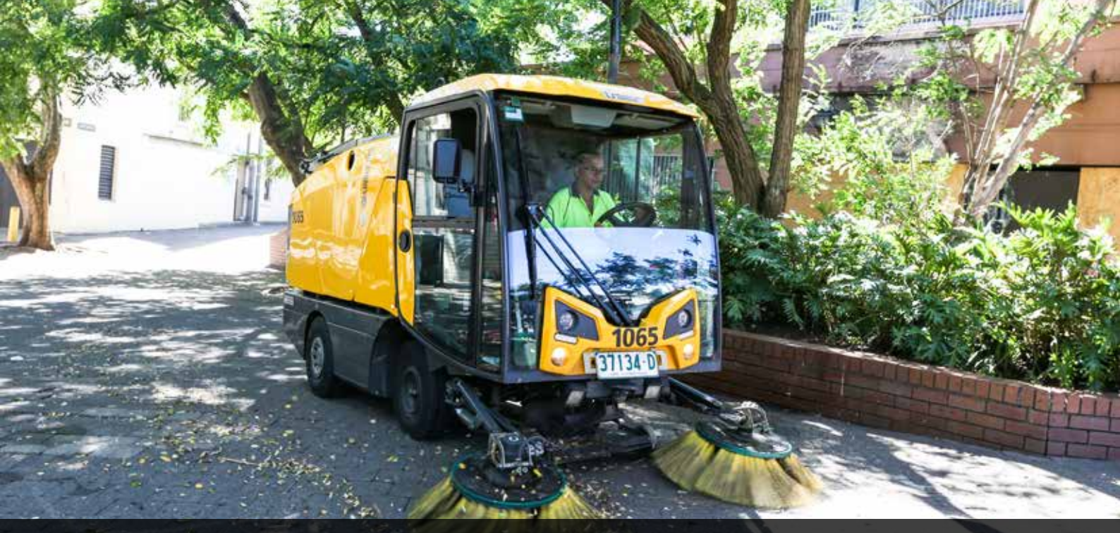
Modern workplaces are increasingly reliant on technology and demand higher level literacy and digital literacy skills from employees.