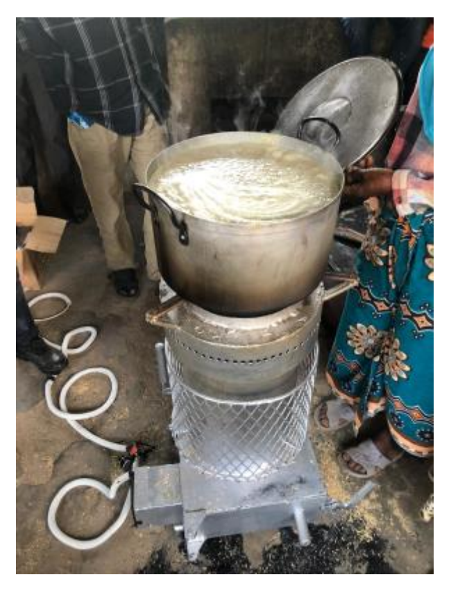
2 - Piloting phase - no firewood used for cooking this porridge, just organic waste, mostly rice husks which are readily available in the area.