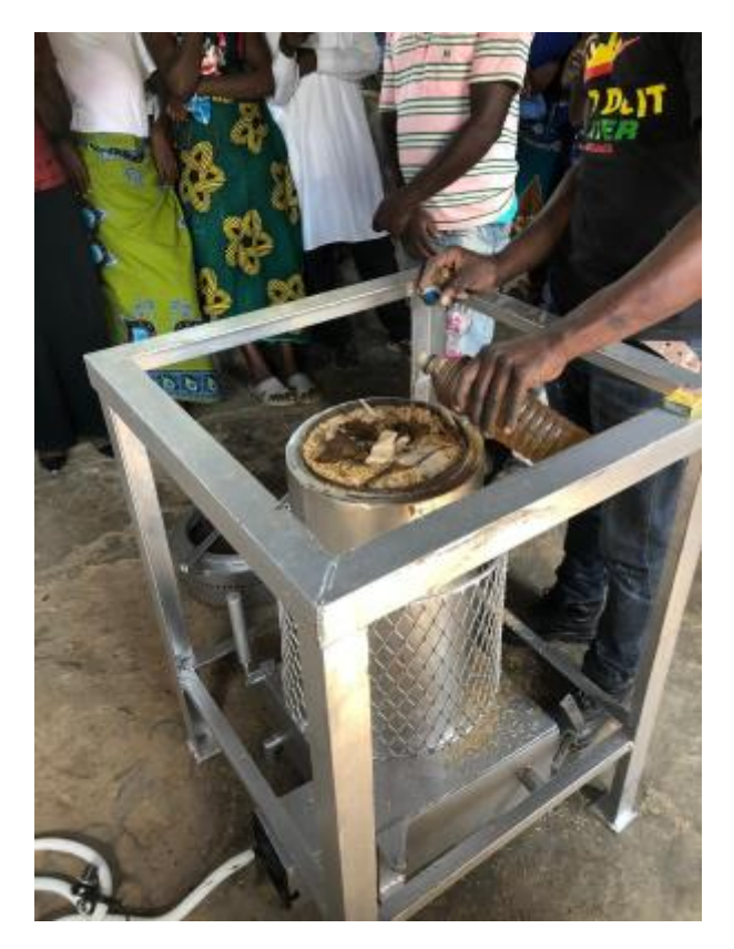
1 - Piloting phase - no firewood used for cooking this porridge, just organic waste, mostly rice husks which are readily available in the area.