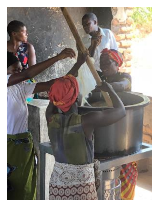
3 - Piloting phase - no firewood used for cooking this porridge, just organic waste, mostly rice husks which are readily available in the area.