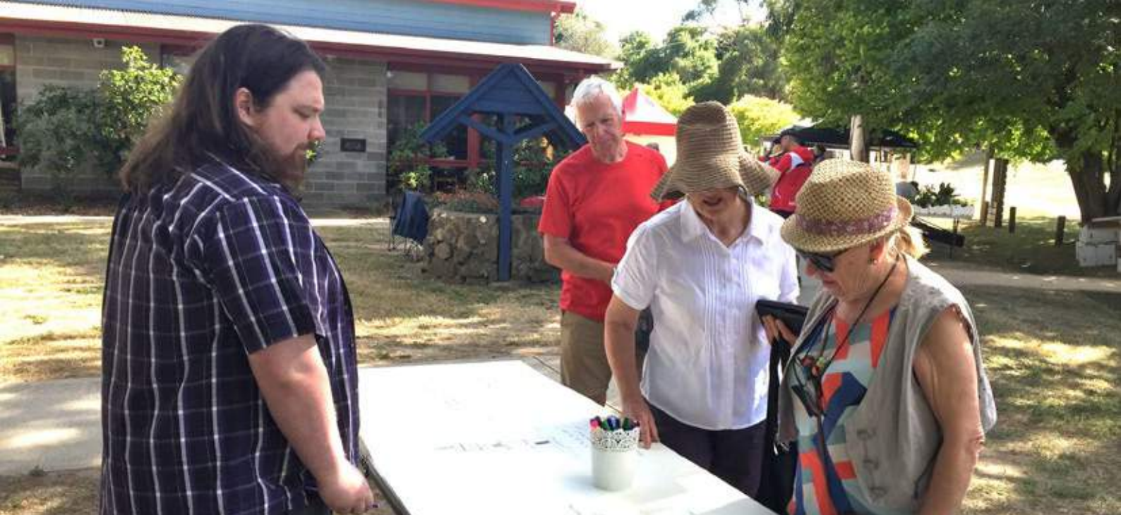
Conducting research at the farmers' market.

that cross fertilisation of ideas or opportunities to meet like-minded friends.