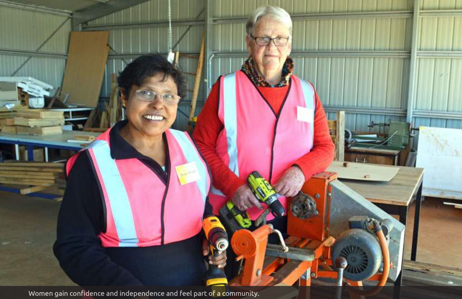
Women gain confidence and independence and feel part of a community.

much or get out with him on the tools and help. He did all sorts of jobs like painting, installing antennas, putting up sheds.'