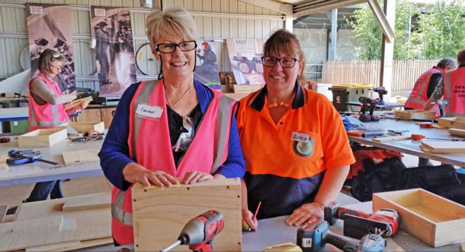
The Supporting and Linking Tradeswomen (SALT) project has been a great support and inspiration.