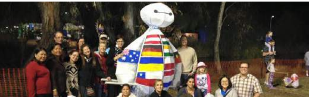
Queensland's Western Downs Library's Chinchilla Conversations in English group at Dalby's festival.

In South Australia Community Centres SA has developed a series of free professional development webinars for ACE providers designed to assist in the design, documentation, delivery and assessment of an adult community education (ACE) learning program.