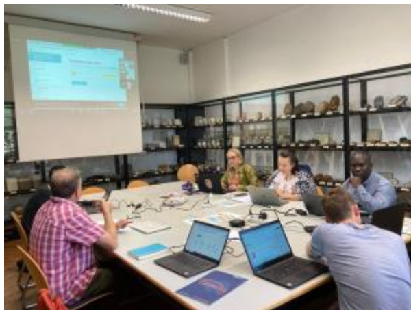
5 - Project partners developing content for the online course