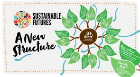
3 - SFG Network new organigramme