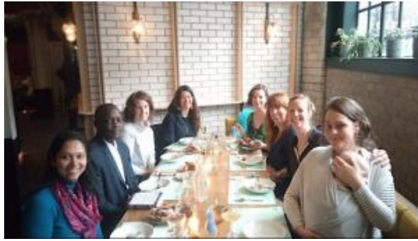
2 - Symposium Dinner - SFG Network Scottish hub members